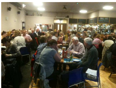
On the night at Barnhall, heads down, glasses full, thinking caps on...