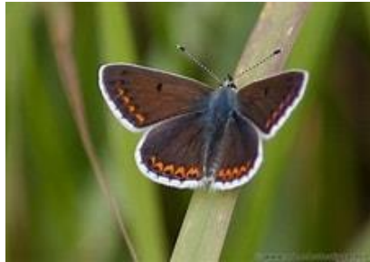
Brown Argus Butterfly