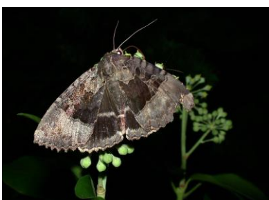
Old Lady Moth

On the evening of Saturday 21 st August a Moth Night was held at the Wick Country Park with a telescope available for star gazing. We were lucky with the weather as we managed to avoid any showers and the weather was fine for the whole evening. The moth attracting light was set up at around 8.45pm and was attracting moths more or less straight away. Several species were identified with such wonderful names as Old Lady, Ruby Tiger and Flame Shoulder. The variety of moths coming to the light was fascinating being of various sizes, shapes and colours. In addition to the moths, the resident flock of Canada Geese were very active, flying around calling to each other, and we also saw/heard a couple of Foxes. A Pipistrelle Bat was also identified with a bat detector – probably feeding on the moths!