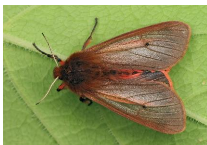
Ruby Tiger Moth