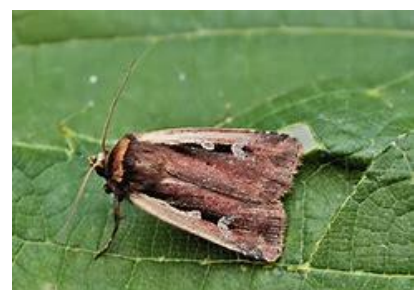
Flame Shoulder Moth