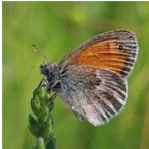
Small Heath Butterfly

The monthly wildlife walk for August took place on Wednesday 25 th . Weather was fine with some sunny spells which brought out a few butterflies, including Small Heath which is a new one for the park list and Brown Argus which looks like it is breeding in the park. The Brown Argus, despite being brown is actually a member of the “blue” butterfly family. Its main habitats are chalk and limestone grasslands so this is a very good record for the park. We did see 1 in 2020 but this year saw 3 on the walk, one of which looked like it was trying to lay eggs. Having a colony of these beautiful butterflies in the park is great news. We also saw a splendid hoverfly and managed to identify this as Helophilus pendulus and a bit of internet research later found that it is known as the “Footballer Hoverfly” because of its stripy thorax. It is also called the “Sunfly” because it often sits on leaves out in the sun – which is exactly what it was doing when we saw it.